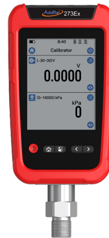
Additel 273Ex with ADT158Ex module