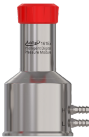
ADT161Ex pressure modules - See ADT161 Datasheet for more info