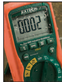
Waterproof feature protects meter when taking a measurement in a wet environment