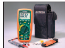
Each meter includes carrying case, hanging strap, Type K thermocouple (EX520, EX530), and test leads

EXTECH INSTRUMENTS CORPORATION 285 Bear Hill Road, Waltham, MA 02451-1064, U.S.A. Phone: 781-890-7440 • FAX 781-890-7864 ISO 9001:2000 CERTIFIED