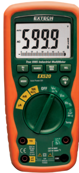
Model EX520 • True RMS • 6000 count • Type K Temperature • Capacitance