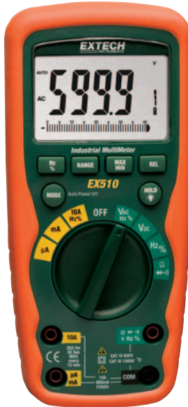
Model EX510 • 6000 count