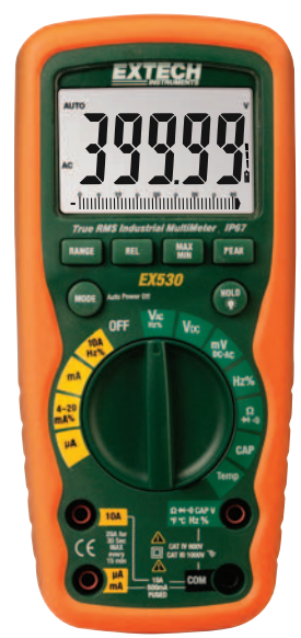
Model EX530 • True RMS • 40,000 count • Peak Hold • Type K Temperature • Capacitance • 4 to 20mA